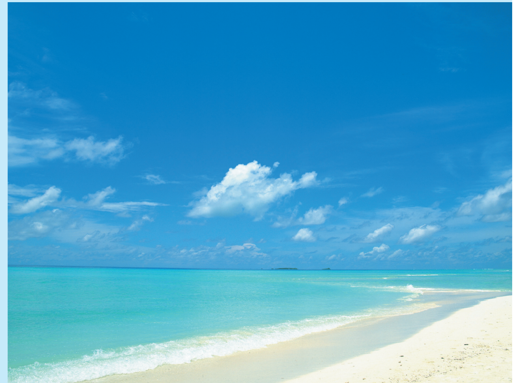
Okinawa Prefectural College of Nursing